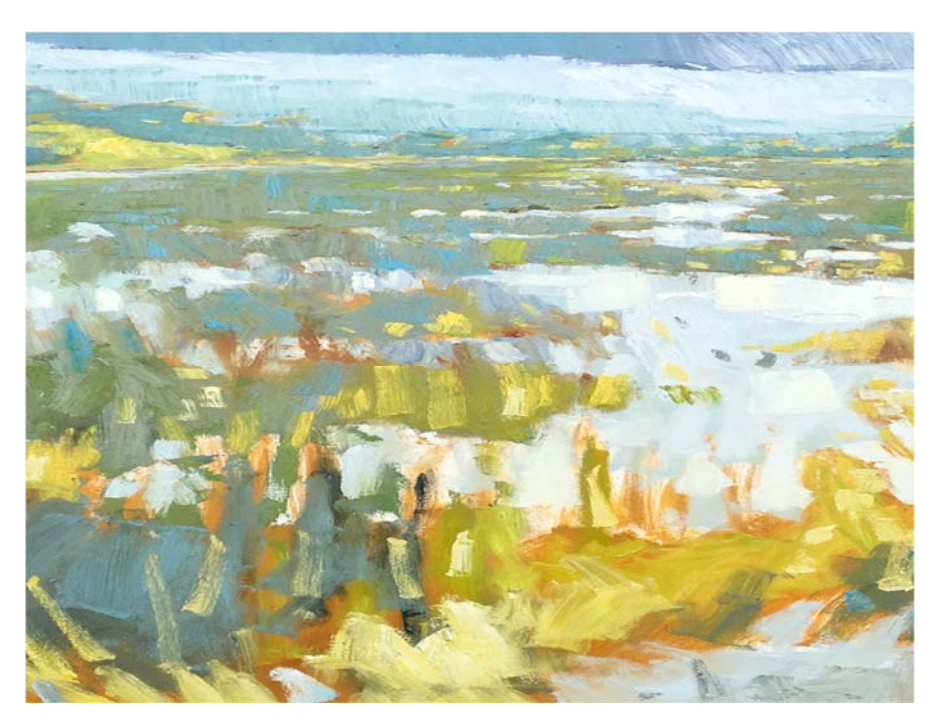
CANAL BY THE RAILROAD TRACKS, OIL ON CANVAS, 48 X 60°, 2016