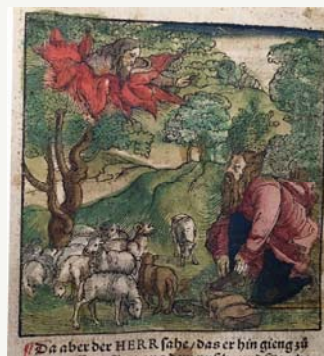
Bible. German. Luther. 1535. Second complete edition of Luther's translation of the Bible. New woodcuts for complete German Bible by Lucas Cranach, the younger, and one or two others. Moses and the burning bush.