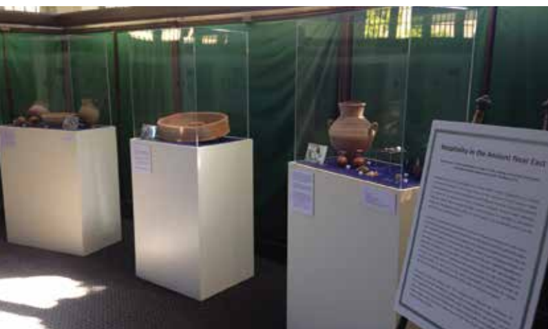
Ancient artifacts on the theme of "hospitality"