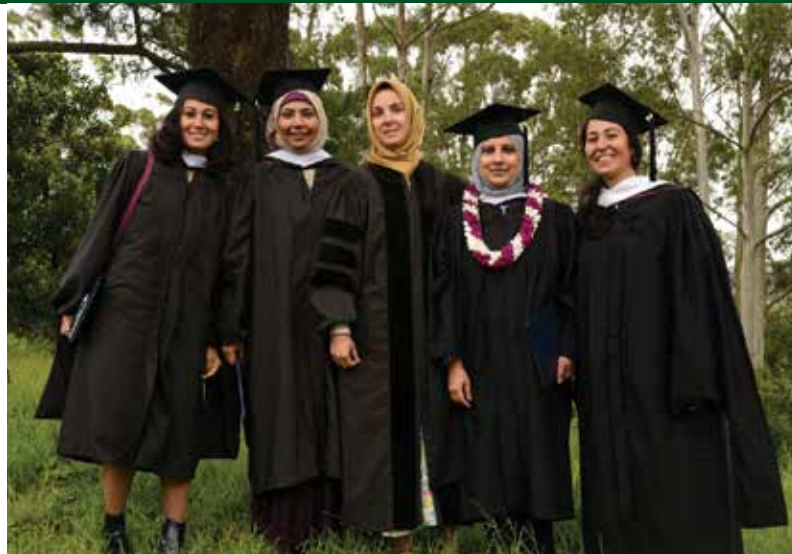
CIS graduates at the 2017 GTU Commencement

Our 45 CIS MA and PhD students and graduates, along with CIS faculty and visiting scholars, are representative of the global diversity of the Islamic tradition; they come from 17 different countries and speak, read, or write in 32 languages!