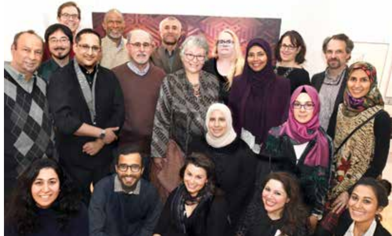
CIS faculty and students at Reverberating Echoes

Islamic studies is integral to how we think about, teach, and practice interreligious studies. We need to study and reflect upon the Islamic tradition and diverse Muslim practices