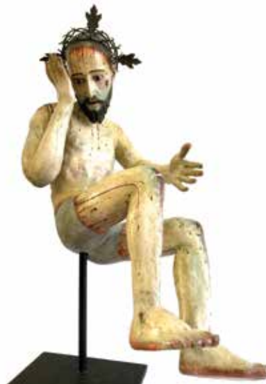
Ecce Homo carved wooden sculpture