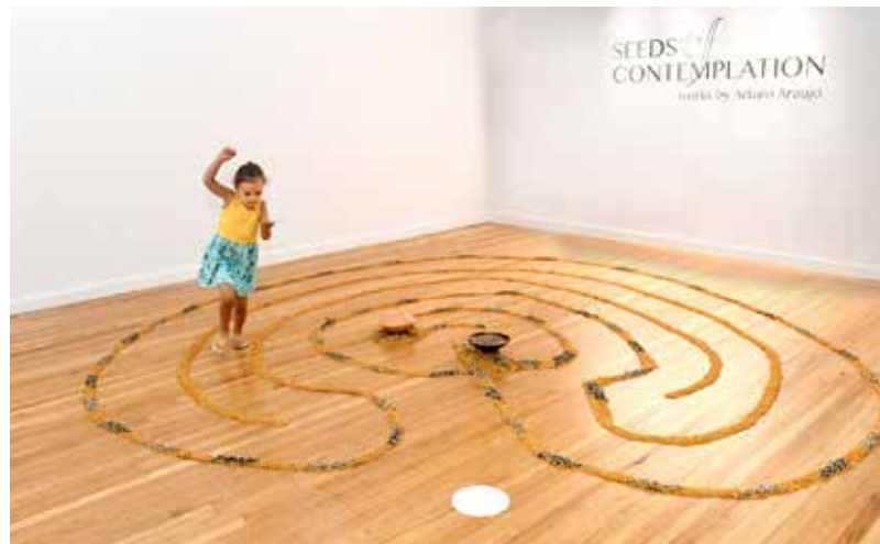
Walk As If You Are Kissing the Earth With Your Feet corn labyrinth

What is a human person? What is suffering? This exhibition explores those questions, theologically and artistically, through the presentation of Spanish Colonial and